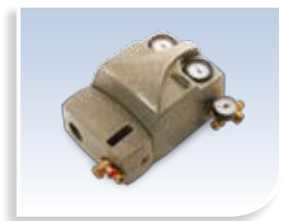
Dual stream pump station