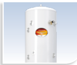
Kingspan Tribune hot water storage tank available in 60, 80 and 119 gallons