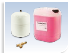
Expansion tank, glycol, connection kit and all other required components