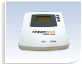
Differential temperature controller