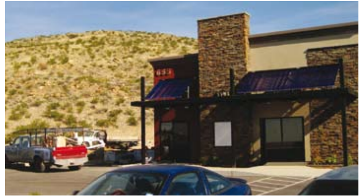
Also suitable for commercial installations