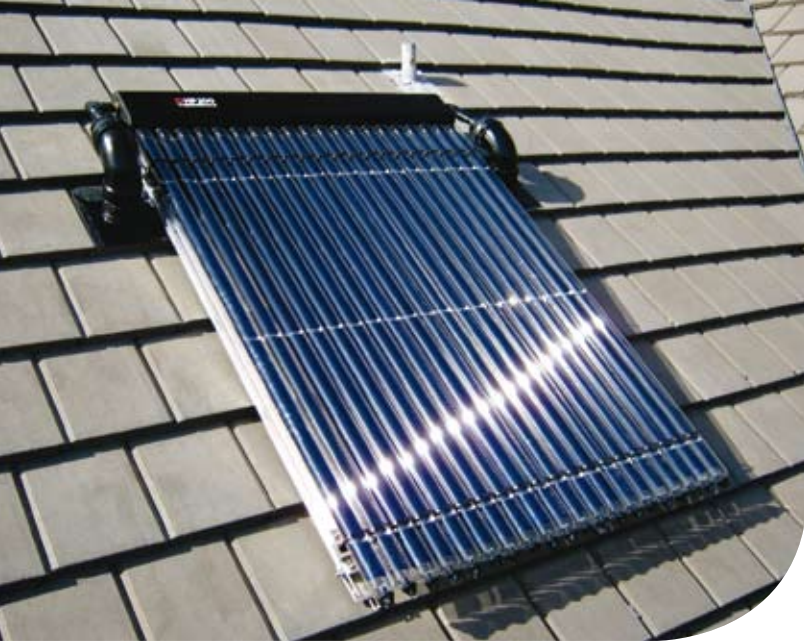
This is a typical 20 tube collector for 1-3 people on a 35° south facing roof