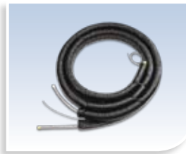
Insulated flexible stainless steel piping